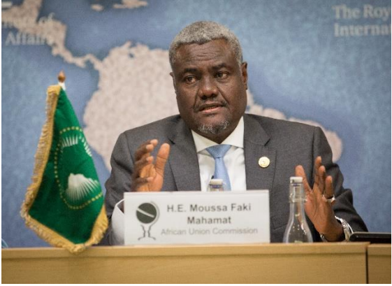
H.E. Moussa Faki Mahamat Chairperson, African Union Commission